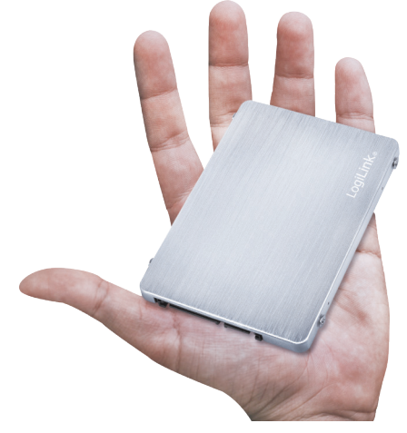
Lightweight and Compact