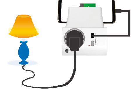
or charge through USB port while using the socket for other electronics.