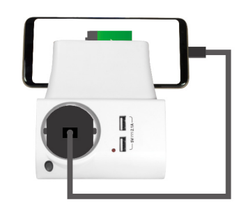
Charge the USB device with the USB power adapter.