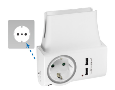
Plug in to a socket.