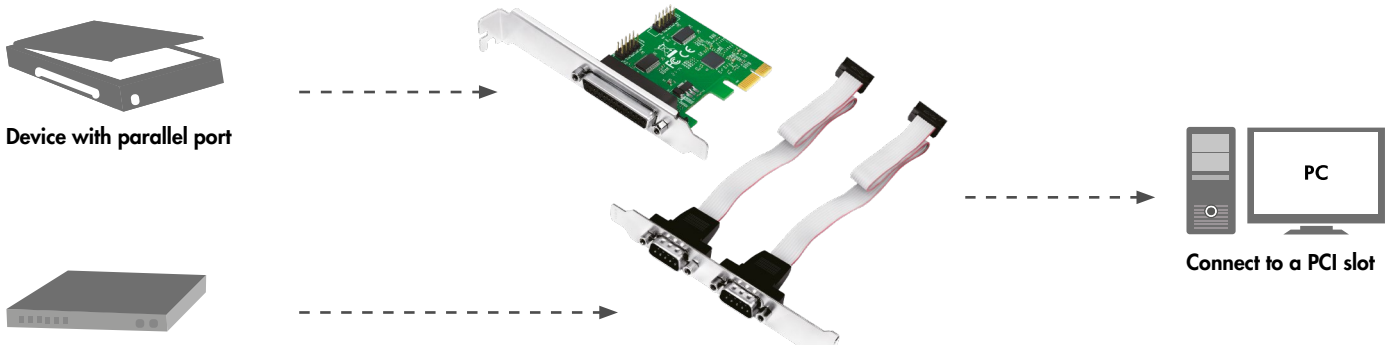
Serial device with D-Sub 9P

Download the driver online if required: http://downloads.2direct.de/treiber/PC0033.zip