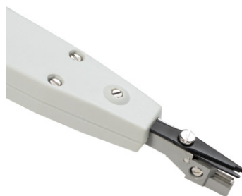
Wear-resistant Cutter Head